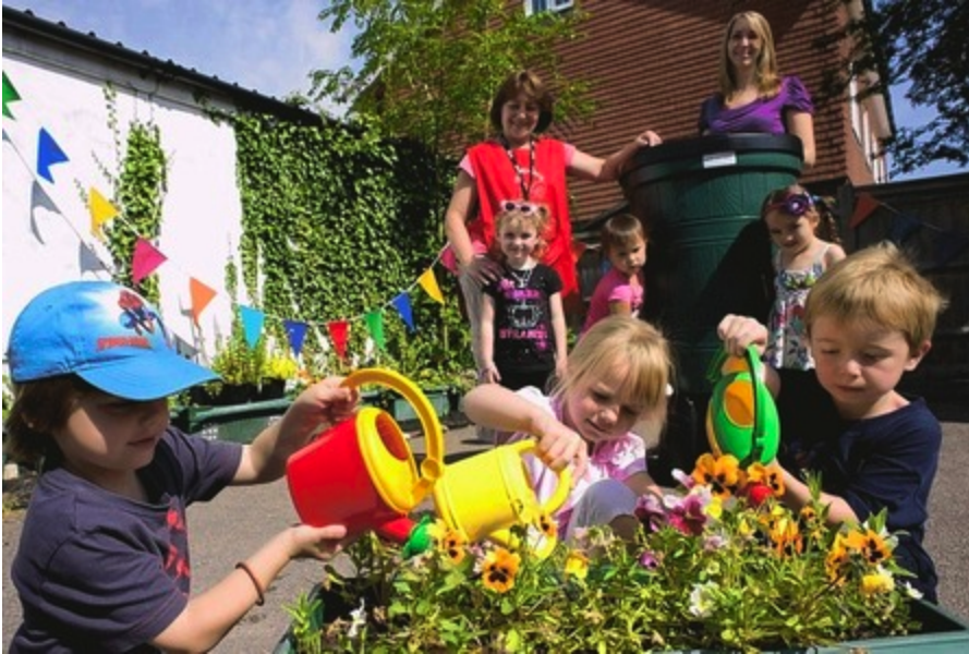
Plants and/or animal